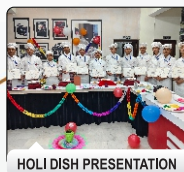
HOLI DISH PRESENTATION