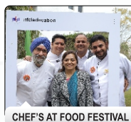
CHEF'S AT FOOD FESTIVAL

NFCI is an institution famous for organizing plenty of activities that go a long way to enhance the student's skills and bring out their hidden talents and capabilities. Therefore, we are creating a well-groomed, completely well-developed individual ready to take on the world. So, do you want to be a leader in the modern hospitality industry?