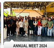
ANNUAL MEET 2024