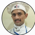
Mukesh Holiday Inn, Jaipur