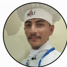
Kirnesh Holiday Inn, Jaipur