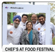
CHEF'S AT FOOD FESTIVAL

NFCI is an institution famous for organizing plenty of activities that go a long way to enhance the student's skills and bring out their hidden talents and capabilities. Therefore, we are creating a well-groomed, completely well-developed individual ready to take on the world. So, do you want to be a leader in the modern hospitality industry?