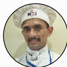
Mukesh Holiday Inn, Jaipur