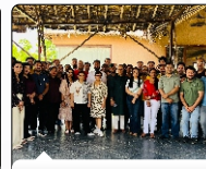
ANNUAL MEET 2024