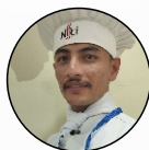
Kirnesh Holiday Inn, Jaipur