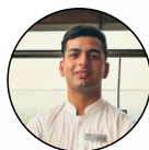
AARIF Radisson Blu