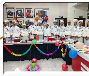
HOLI DISH PRESENTATION