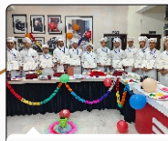
HOLI DISH PRESENTATION