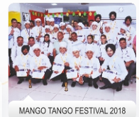
MANGO TANGO FESTIVAL 2018