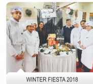
WINTER FIESTA 2018