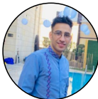
Babender Radisson Hotel, Gurgram