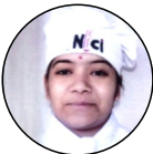
Meghna Ramada Plaza, Chandigarh