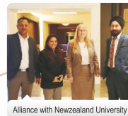
Alliance with Newzealand University