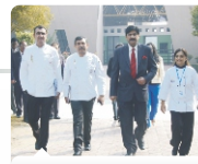
CHEFS AT FOOD FESTIVAL

NFCI is an institution famous for organizing plenty of activities that go a long way to enhance the student's skills and bring out their hidden talents and capabilities. Therefore, we are creating a well-groomed, completely well-developed individual ready to take on the world. So, do you want to be a leader in the modern hospitality industry?