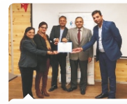
ALLIANCE WITH NSDC