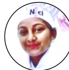
Himani Dubai Adventure Sports, Dubai