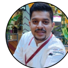
Manish HMSHOST, Dubai