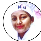
Himani Dubai Adventure Sports, Dubai