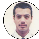
Upender Radisson Blue Resort, Goa